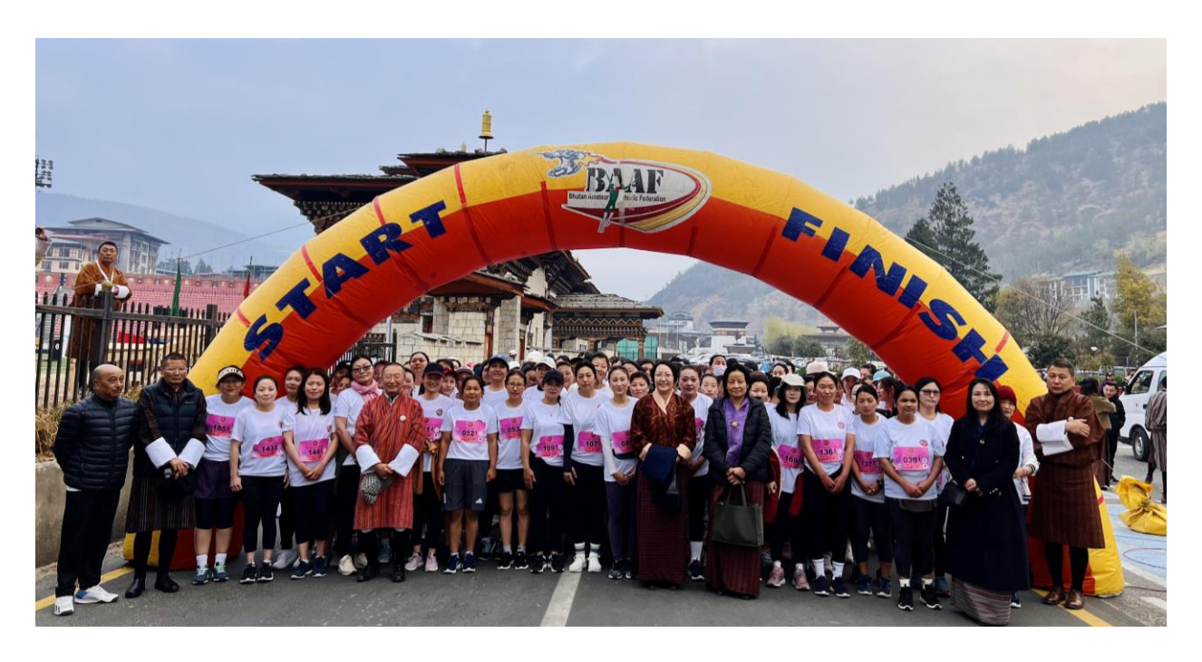
9th March, 2024

In our effort to promote the health and well-being of civil servants and as part of the well-being programme, the Royal Civil Service Commission has organised a marathon for civil servants. It aims to cultivate a healthy lifestyle for a healthy body and mind, both of which are important for being a civil servant. It also provides a platform for networking among the participants.